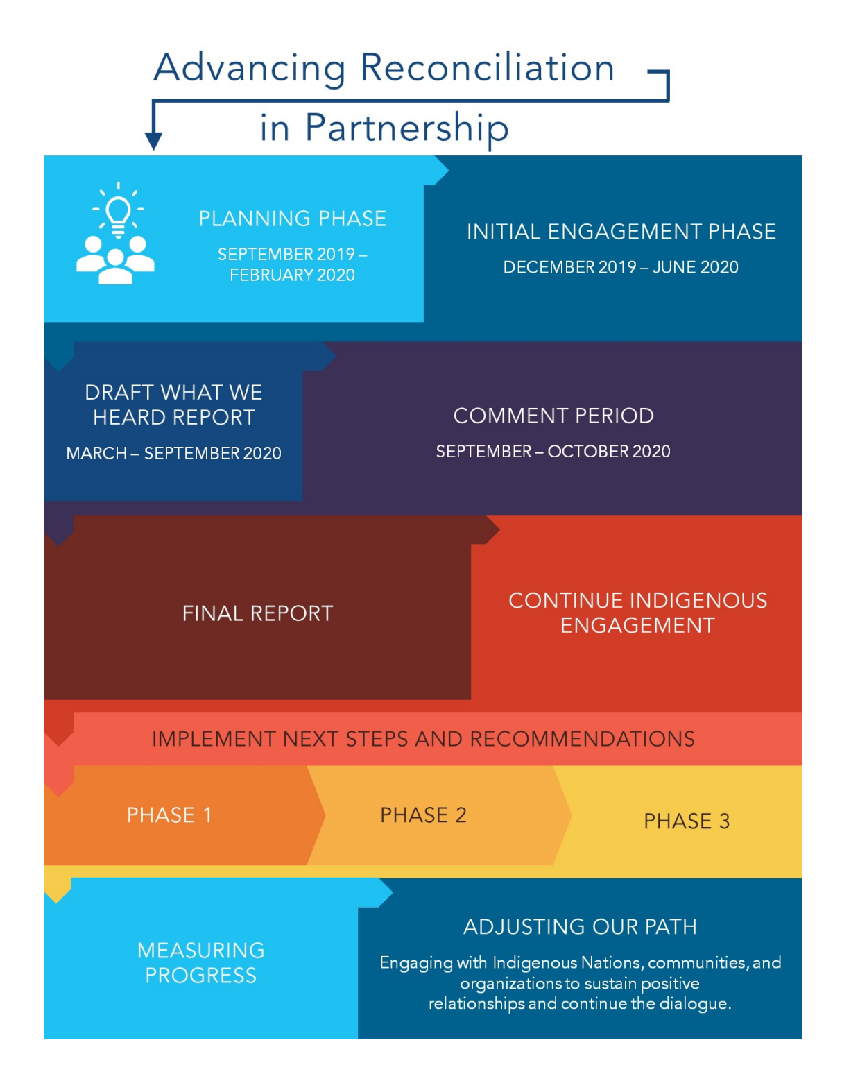
Figure 2: Reconciliation Strategy Process

The diagram below illustrates the process for completing the Reconciliation Strategy and contextualizes the work to date.