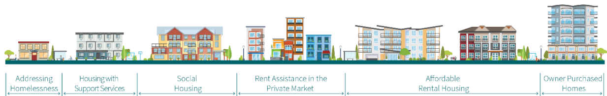
Figure 1: Housing Spectrum

This program framework outlines the overall program intent, goal, principles, target populations, core elements, standards and guidelines, monitoring and reporting requirements, and defines the roles and responsibilities of project partners in the delivery and management of the Affordable Home Ownership Program.